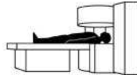
Open MRI scanner